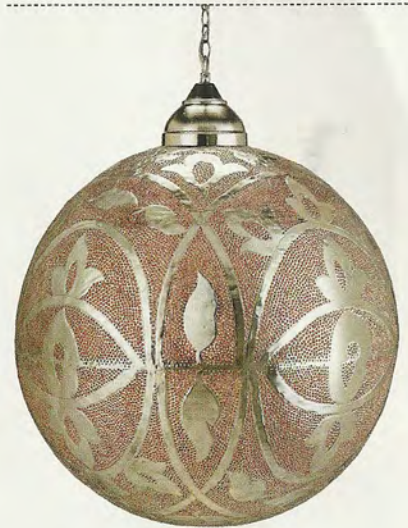
Sahara, $2,466, Currey & Company, curreycodealers.com.