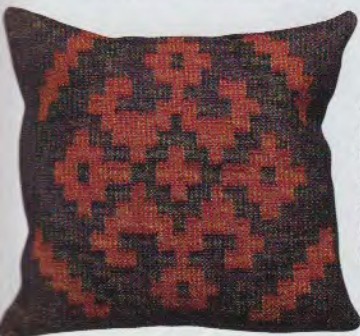
A new woven pillow has the look of an old kilim, available at Elizabeth Interiors.