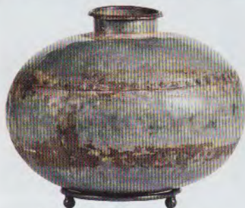
A metal Moroccan urn on an iron stand, from Kantelberg & Co.