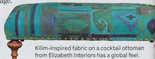
Kilim-inspired fabric on a cocktail ottoman from Elizabeth Interiors has a global feel.