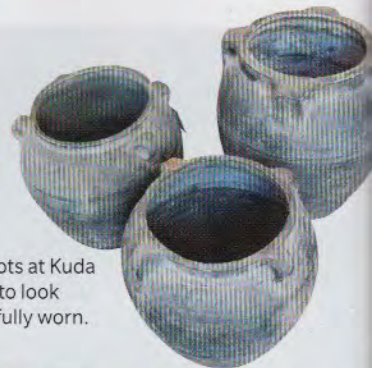
These pots at Kuda in Toronto look wonderfully worn.