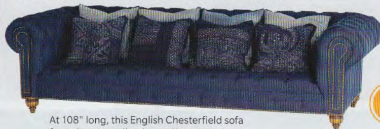
At 108" long, this English Chesterfield sofa from the RLH collection at Elte makes a grand statement.