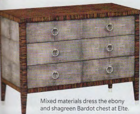
Mixed materials dress the ebony and shagreen Bardot chest at Elte.