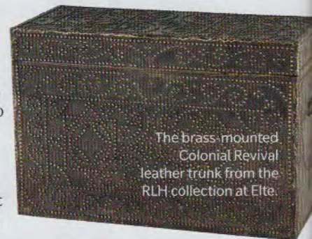
The brass-mounted Colonial Revival leather trunk from the RLH collection at Elte.