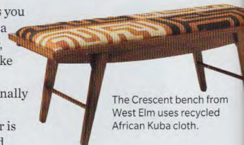
The Crescent bench from West Elm uses recycled African Kuba cloth.