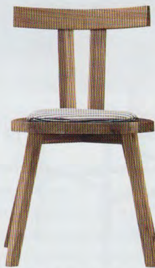
Gray 23 chair by Gervasoni. Oak. 31½" h. x 19" w. x 18½" d. From $915. At Quasi Modo Modern Furniture.