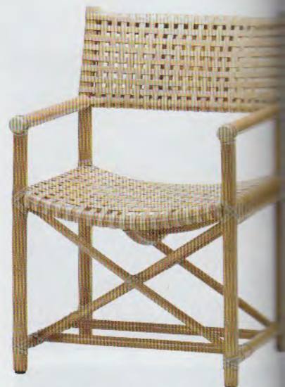
Laced rawhide chair by McGuire. Rattan; rawhide. 34" h. x 23" w. x 24" d. $1,375. At Snob.