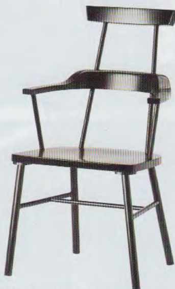
PS 2012 chair. Wood-plastic composite. 30" h. x 20½" w. x 18" d. $99. At Ikea.