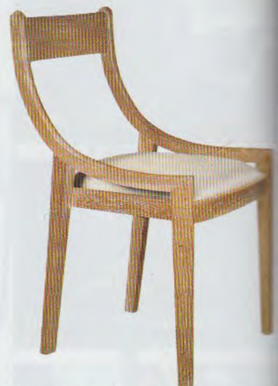
Alexa chair by Bungalow 5. Oak; linen. 34" h. x 21" w. x 20" d. Approx. $500. At retail stores across Canada.