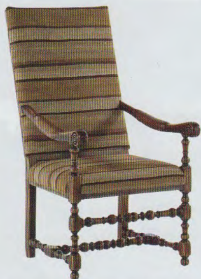
Fauteuil Louis XIII chair by Ralph Lauren Home. Walnut; wool; leather. 47" h. x 26" w. x 32" d. $3,700. At Lindsey Steek & Company.