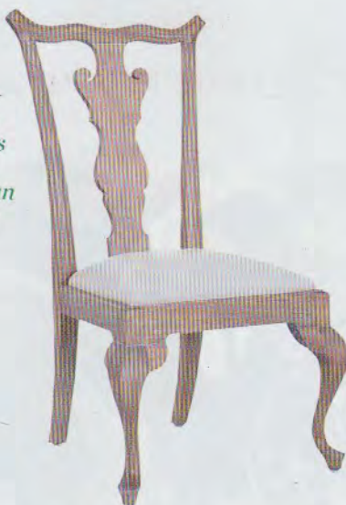
Bobby chair by Oly Studio. Mindiwood; leather. 40" h. x 23" w. x 24" d. $2,495. At Celadon.