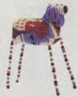
MONKEYBIZ LION, $150, EATMYWORDS.ORG.

West Elm opens its first Vancouver store this fall!