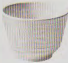
LOREN KAPLAN CEREAL BOWL, $8, WESTELM.COM.